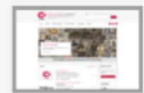
Eventos | Primeros Wo ...