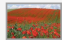
En el campo de Flandes ...