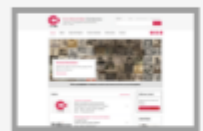
Matukio | Kwanza Wo ...